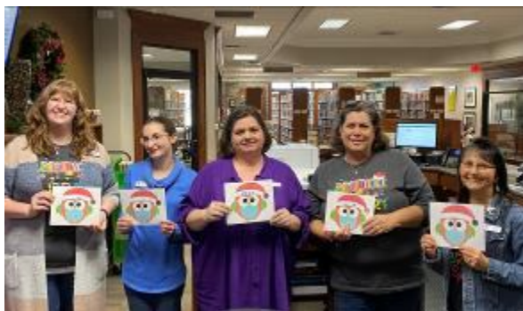
FOUCL gifted UCPL staff with Aldi's Gift Cards at Christmas.